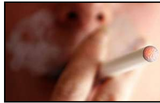
E-CIG PRODUCES WATER VAPOR

from. HCID plans to have other choices available by mid-to-end of April. As some readers may know, the e-cigarettes use no tobacco; no flame; no ashes; no odor; no smoke; & no heat. The e-cigarette can be used in restaurants, bars, casinos, airports, office, and other places where a regu-